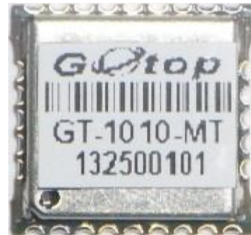
Figure 1: GT-1010-MT Top View