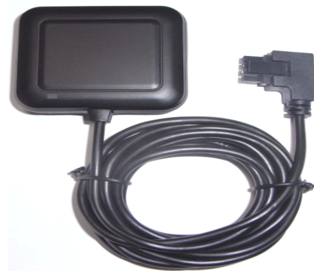
GRM-5546-UB4MX20 Top View