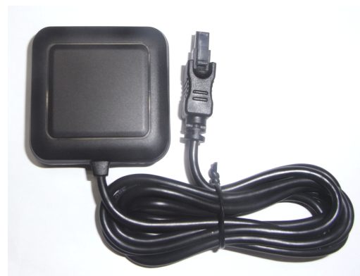
GGM-5546-UBMX20 Top View