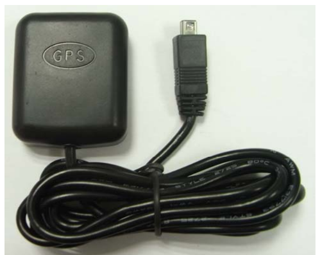
GGM-4538-SKR139415 Top View