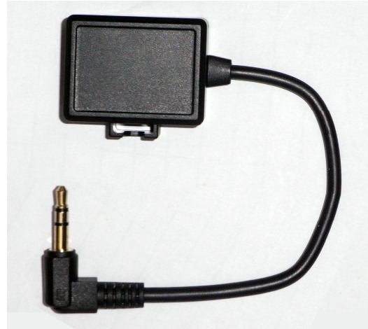
Figure 1:GGM-3325-MTR3WDC015 View